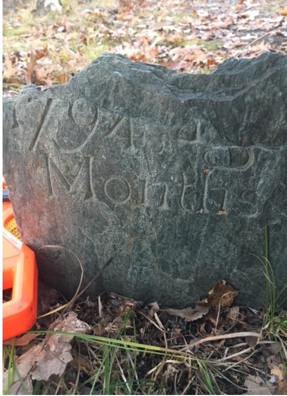
Pollack Brook Cemetery, 1794 headstone