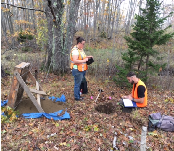
Phase 1, Prehistoric Archaeological Survey at Pollack Brook, 2017.

In 2017, the town completed a phase 1, prehistoric archaeological survey on both sides of Pollack Brook west of Spurwink Ave. During that survey, it became clear that there is an extensive cemetery located on the north bank. There is a small Jordan family cemetery located near the point with the Spurwink Marsh that includes several traditional upright headstones. Closer to Spurwink Ave, there is a second and larger cemetery of 35+ markers that dates to the late 1700's. The markers are slate, and only one has any readable marking, dating to 1796. No other markers appear to have any inscriptions. At the conclusion of the Pollack Bridge project, the town will evaluate how to appropriately mark this cemetery.